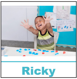
Name photo template